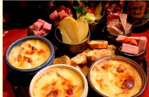
For more recipes click on the picture